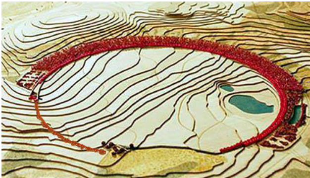
What the Circle of Embrace actually looks like. The original giant crescent still sits naked on an open field and the flight path still “breaks the circle” at the upper crescent tip. Remove the explicitly broken off part of the circle (in orange), and what symbolically remains standing in the wake of 9/11 is the same giant Mecca-oriented crescent the Park Service promised to change. It constitutes a classic “mihrab,” the Mecca-direction indicator around which every mosque is built, and will form the centerpiece for the world's largest mosque.